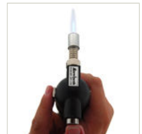
Step 3 For a continuous flame, push the "continuous" button in while holding the trigger in.