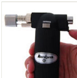
Step 1 To turn on your torch, pull down on the safety to release.