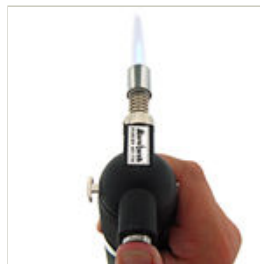
Step 2 Push trigger to ignite the torch. Hold trigger in to keep flame on.