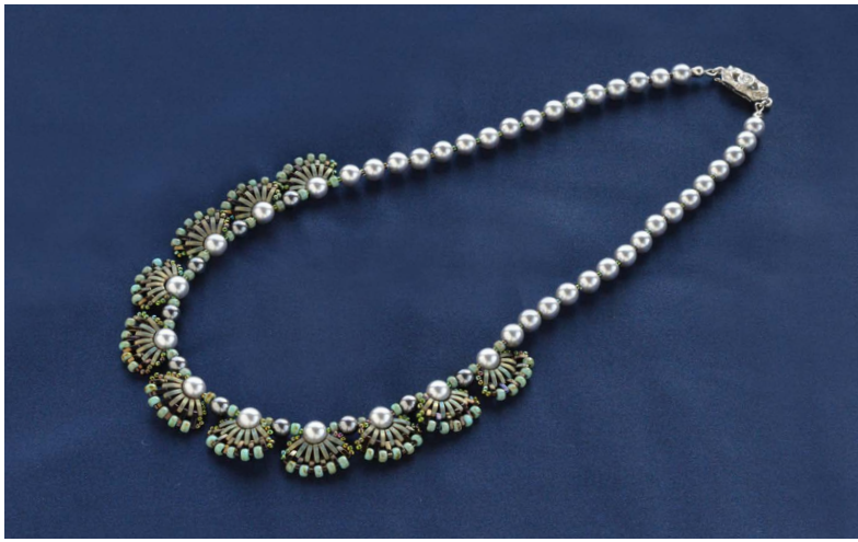
Necklace Size: About 43cm (including metal parts).